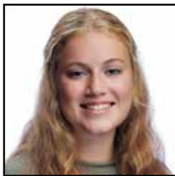
Anne Gray Riley High School