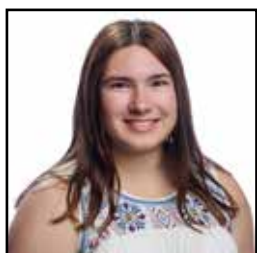
Madison Ring Riley High School